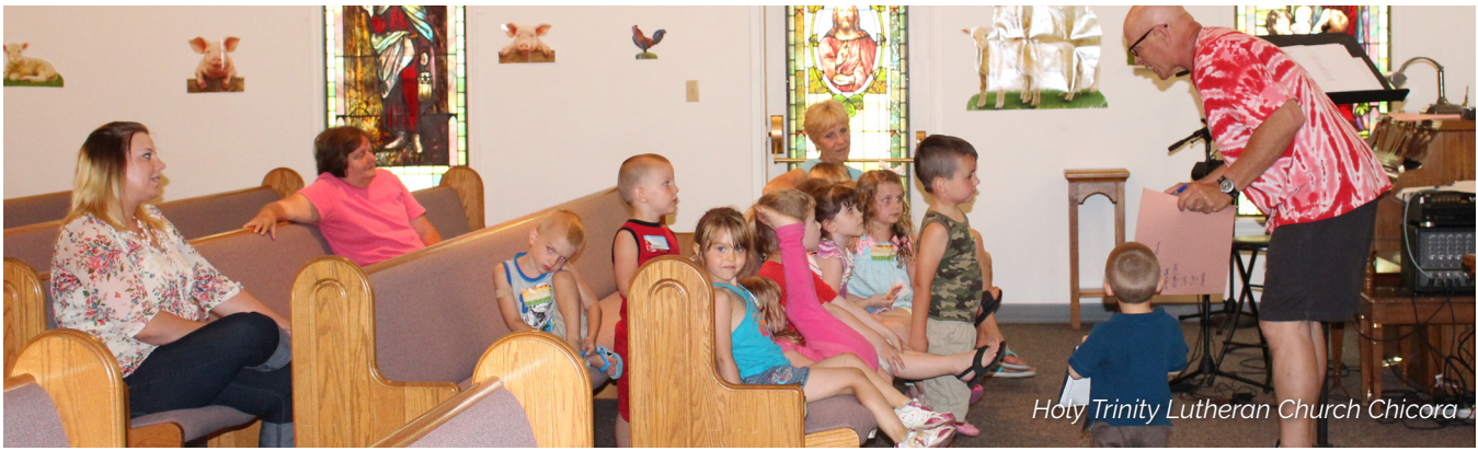
Holy Trinity Lutheran Church Chicora